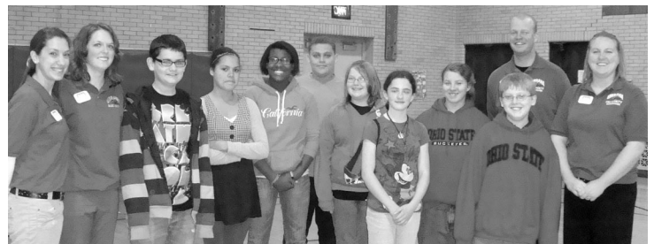
TFBT students learned about college at The College Day Program.

Do you know that there are over 150 Lunch Buddies in the Troy City Schools? If you are interested in volunteering your lunch time once a month for a student in grades 4, 5, or 6, contact Cheryl Cotner at ccotner@TheFutureBeginsToday.org or 332-0467.