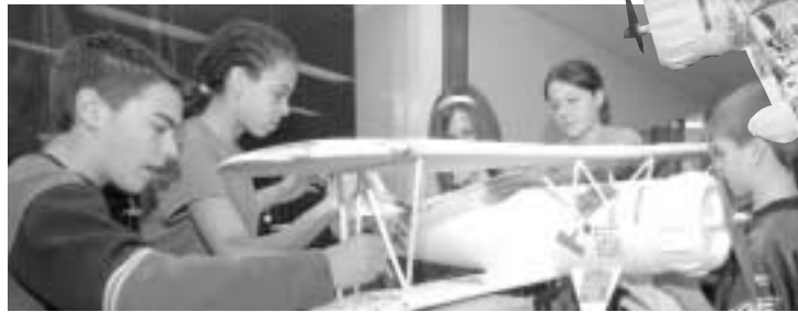
Students apply their pieces of artwork to the plane.

Fiberglass replicas of the famous WACO bi-plane are being featured during Troy's "Sculptures on the Square" this summer. With the help of The Future Begins Today , the WACO Historical Society and the Van Cleve art department, more than 370 Troy students and staff at Van Cleve 6th Grade School have decorated one of the 26 planes that are on display in the Troy Square.